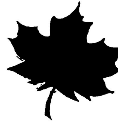
Fall has arrived! Start those leaf blowers!

Help: Rain Gardens can help to reduce local flooding issues.